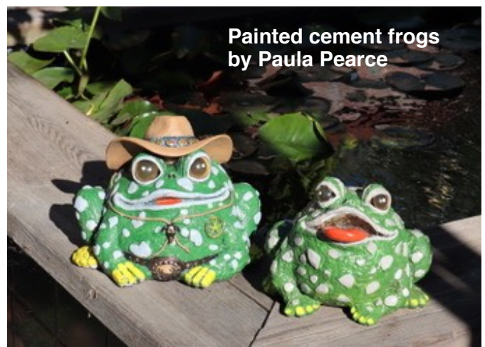
Painted cement frogs by Paula Pearce