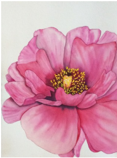
Kathy Byrne - "Summer Glory" 14x11 watercolor "Thinking of Fall" 11x14 watercolor "Here are a couple of paintings I completed in the last month."