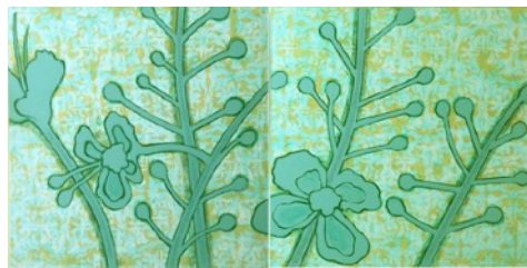
Gail Mardfin - ABOVE: "Madalyn" 14x11 pastel BELOW: "Whisperings II" 36x72 mixed media