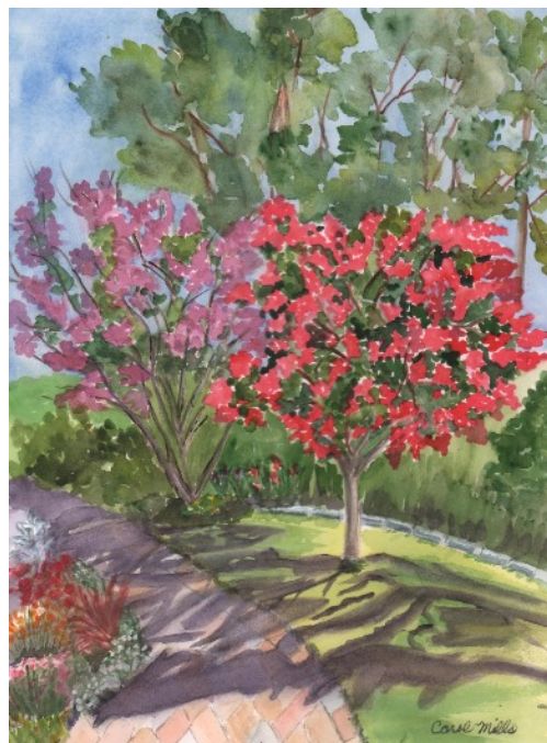
Carol Mills - "Crepe Myrtles" 14x11 watercolor

Just one submission from August's TREE prompt...but remember, you can submit finished paintings at any time!