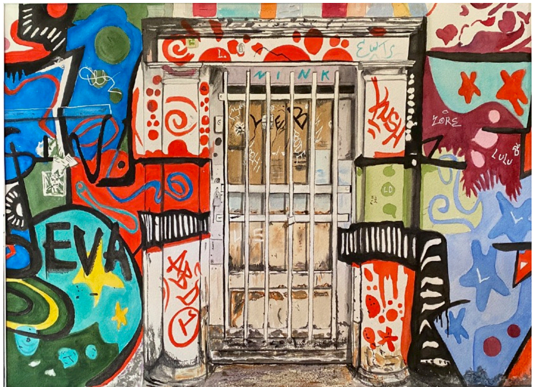
Carol Mills - “On the Edge of Town,” 14x20 watercolor

The museum is currently closed due to the coronavirus pandemic, but hopes to open its doors to socially distanced visitors wearing masks, possibly as early as September or October.