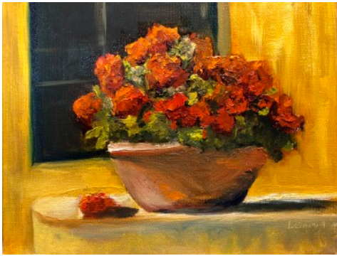
Lonna Necker - “Geraniums” 8x10 oil

You must check out Streamline Art Videos! https://www.youtube.com/user/streamlineartvideo - where you can find dozens of FREE videos ranging from 20 mins to 2 hours – watercolor, oils, acrylics, figures, and California Impressionism, to name just a few.