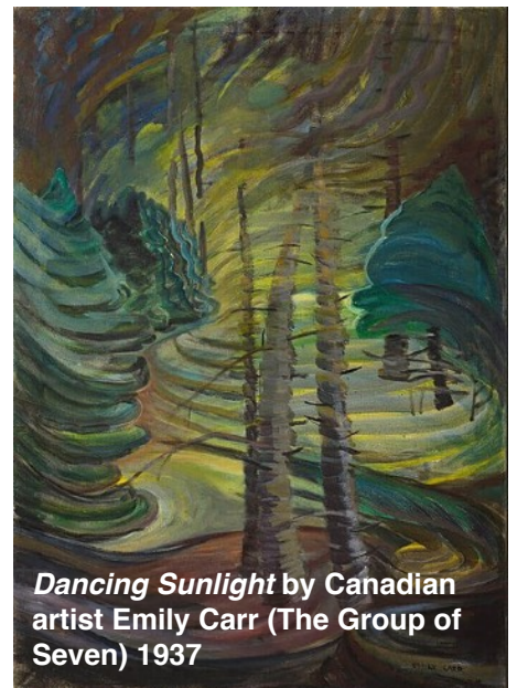
Dancing Sunlight by Canadian artist Emily Carr (The Group of Seven) 1937

And before you get working on your TREES, you may want to check out this excellent Painter's Keys letter online: https://painterskeys.com/trees-2/