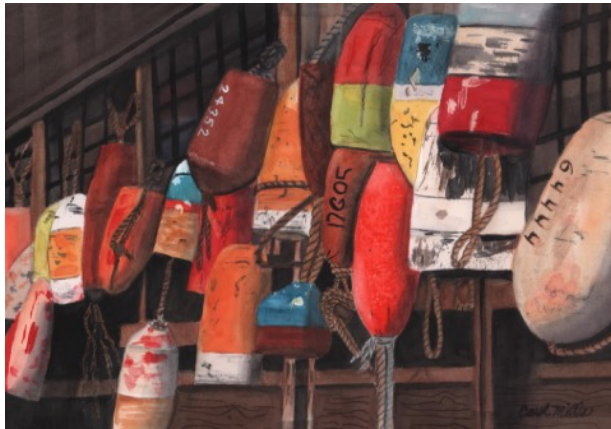
CAROL MILLS - "Buoy" 10x4 watercolor

I recently finished a little painting titled "Succulents in a Tin" 8x6 watercolor. [top]