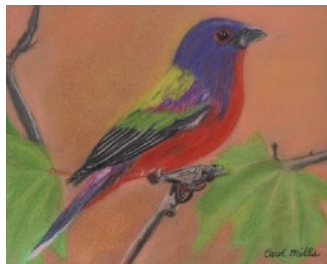
Carol Mills - “Painted Bunting” 8x10 pastel on pastel paper glued to wood canvas

There are small groups of painters going out with masks to do plein air painting all over. And because of our wonderful website and newsletters, we have picked up 3 or 4 new members! Remember to find things to laugh about, limit your news watching, and reach out to others who might need someone to talk to.