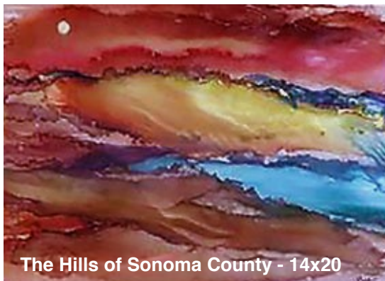
The Hills of Sonoma County - 14x20

Visit Rhea's website at www.InksInMotion.com